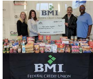
In 2018, BMI FCU contributed a total of $85,701.13 to 57 different charitable organizations.